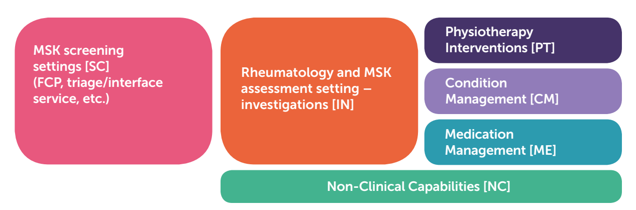
Figure 1: Structure of the Rheumatology Physiotherapy Capabilities Framework across the patient care journey

The sequence of this framework is designed to match the journey or care pathway of the person presenting with symptoms. The first section is on the screening setting, and the next section covers investigations, which will be relevant at initial presentation, but of course also at further occasions post-diagnosis. The capabilities progress onto rehabilitation and "core rheumatology physiotherapy", before broadening to general condition management and medication management. Finally, there are non-clinical capabilities that stand alongside and support the physiotherapist, and physiotherapy support worker where appropriate, through all of the other areas of capability (see Figure 1).